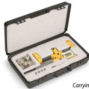
Carrying case available.

Dillon also manufactures highly accurate tensiometers, mechanical dynamometers and crane scales.